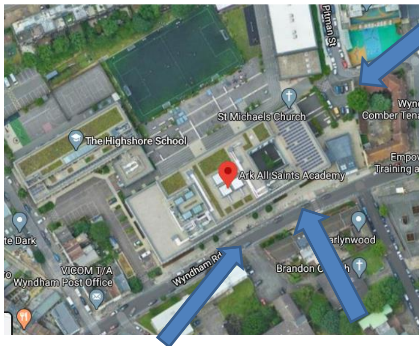
Glass Doors Entrance